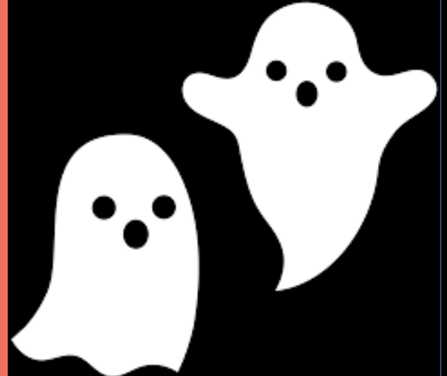
Happy Halloween from us to you!