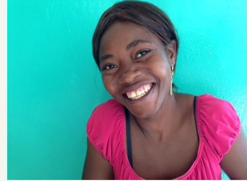
Taken December 2013 in Borgne, Haiti