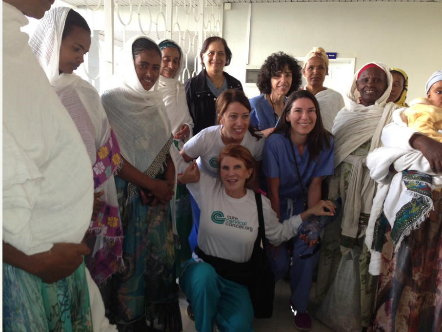
Taken April 2013 at the CCC: "For Our Mothers and Sisters" Clinic in Mekelle, Ethiopia

unsubscribe from this list | update subscription preferences