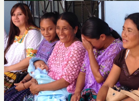
Taken October 2013 in Coban, Guatemala