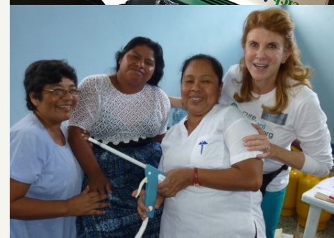
Taken October 2013 in Chisec, Guatemala